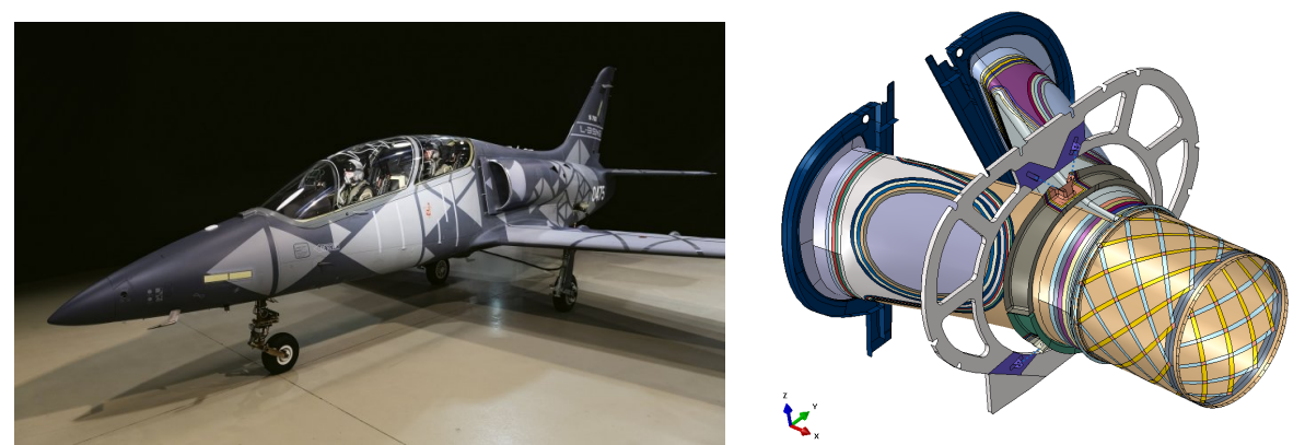
Fig. 1: L-39NG light jet trainer (left) [5]; 3D model of composite ait intake [6]

Our current work is focused on further development of an optical FBG (Fiber Bragg Grating) sensor system, which was designed to monitor behaviour of a composite air intake (Fig. 1, right) for the L-39NG light jet trainer (Fig. 1, left). Previous works were focused on a performance of the air intake demonstrator during the bird and hail impact tests [1, 2] and on the sensor system detection capability [3, 4]. It was proven that method of installation onto composite structure, which was developed previously, is durable and reliable even during the large energy impact detection testing. Now work has progressed to installation and measurement on the first prototype airplane.