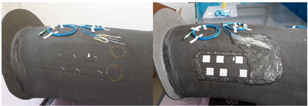
Fig. 2: Optical fiber with 6 FBG sensors attached to the air intake surface (left); optical fiber after lamination, before curing and painting (right)

Four optical fibers with total of forty FBG sensors were installed on the surface of the air intake to monitor its behavior during ground engine test run. Air intake consists of left and righ part, each part is instrumented using two optical fibers with custom-made chains of FBG sensors (6xFBG in the front, 14xFBG in the rear part of the air intake). Optical fibers with outer diameter of 0.150 mm and polyimide primary coating were attached to surface and covered using the thin layer of glass fabric and epoxy resin (see Fig. 2). Individual sensors are placed close to the strain gauges with orientation for the circumferential deformation measurement (in the rear part) or longitudinal deformation measurement (front part). Fiber optic routing on the left side of the air intake can be seen in the Fig. 3 (left). Cured and painted part of the air intake instrumented with strain gauges and FBG sensors (blue cabling) can be seen in Fig. 3 (right).