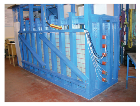
Fig. 4. Views of the solid back wall with six pressure sensors placed in and with the sample into.