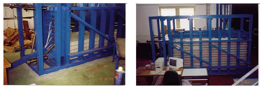
Fig. 1. The first stage of the experimental equipment: a) (Left) Preparation of the experiment E1 in 1998 with a sandy mass of the front half of an experimental space. Four red bi-component pressure sensors in the front wall are obvious, The first (upper) sensor is not placed. b) (Right) The equipment and the mass before the experiment E3 in 2001. The sandy mass fulfils the all experimental space into the equipment.

Among others it was achieved so high passive pressure that the nearest glass side tables cracked but the experiment was successfully finished, however the stand renovation and development was necessary. The first development upgrade of the stand (2<sup>nd</sup> stage) involved a reconstruction the thicker glass sides and due to them a less wide front wall however, the most important progress has been a motor engine movement of the wall and computer control.