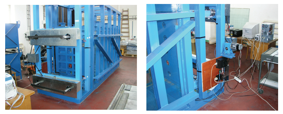
Fig. 2. a) (Left) Overall view of the computer-controlled front wall motor drive after the first development part and restructure of the moved front wall. The motor is on the left; the linear incremental position pick-ups near the skids cannot be seen. b) (Right) Motor drive in detail with hardware and computer behind.

This phase of development of the equipment comprised initially only the provision of front wall motor drive. However, due to the defects of lateral glass walls on both sides of the equipment and the necessity of their strengthening it was necessary to provide also a new, narrower front wall. The concept of this phase was expanded subsequently to include all necessary and possible modifications required for the optimization of the equipment (Figs.2), e.g. upgrade hardware, new software, safety arrangement. The equipment at this stage was tested by the experiment E4/0+2.